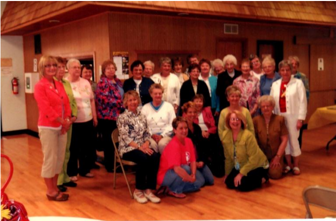
Yelduz Auxiliary members.